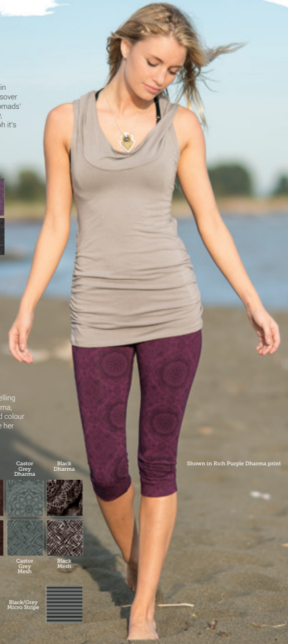
Shown in Rich Purple Dharma print